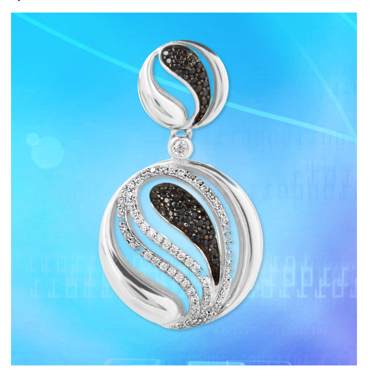
Figure 1. Smart Jewelry

In this article, we will discuss the design challenges encountered when selecting the GPS' low-power LNA for the smart jewelry system.